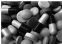
Medication Aide Update 2020

Non-Profit Organization U.S. Postage Paid Texarkana, TX Permit No. 53